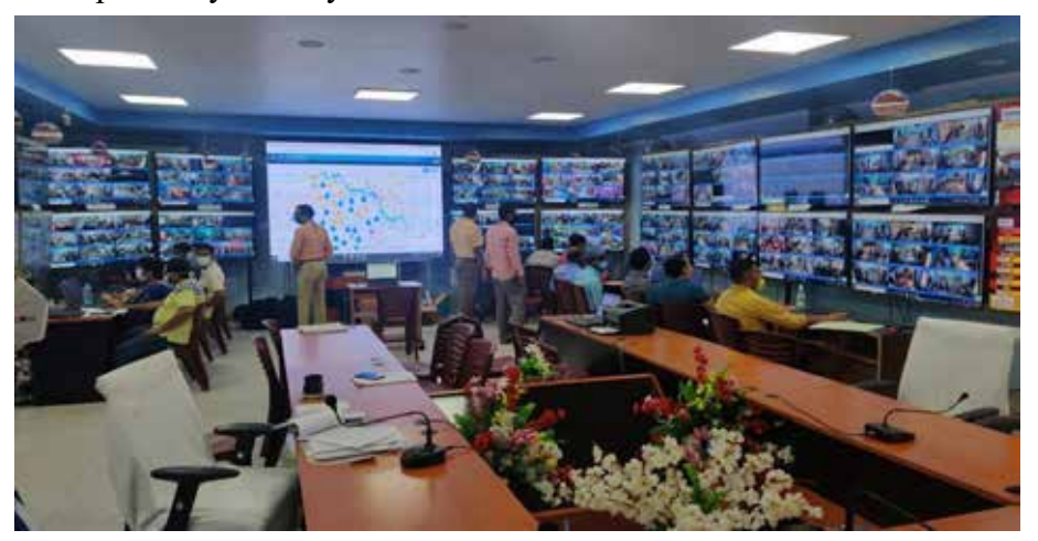
Media Monitoring Cell

9.1.7 Issuance of Authority Letters to Media-persons: Authority letters will be issued only to the eligible persons, as sponsored by the competent authority, the list of which containing the detailed particulars and image of the media persons has to be approved by the Commission well in advance and the distribution of the Authority letters should have to be completed by P-2 day.