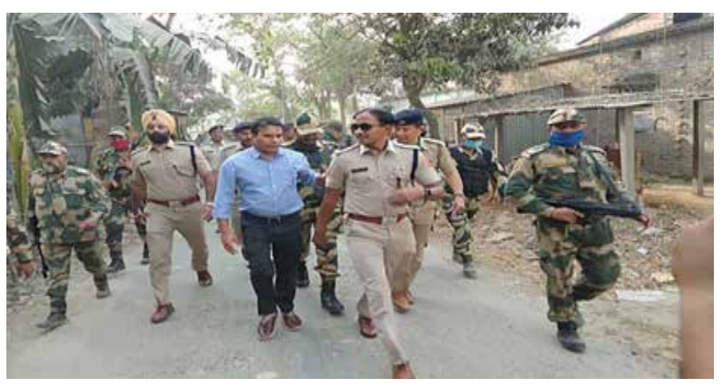
Area domination by Police and CAPF