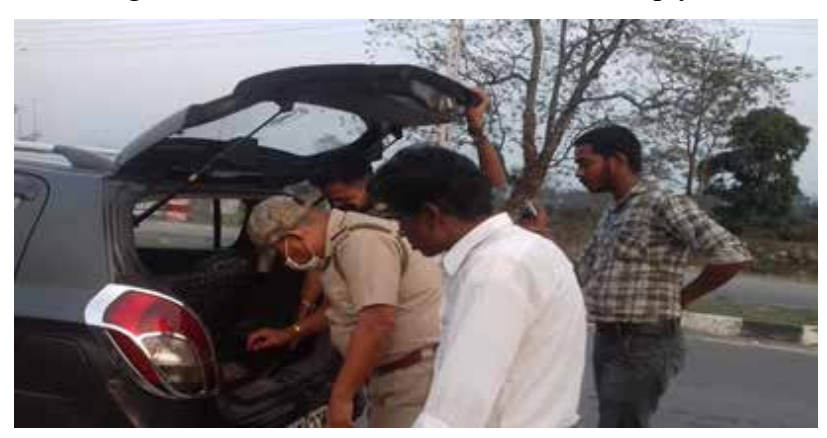
Checking of vehicles by FST