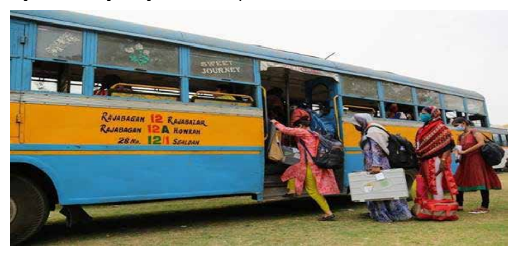
Dispersal of polling parties to polling station