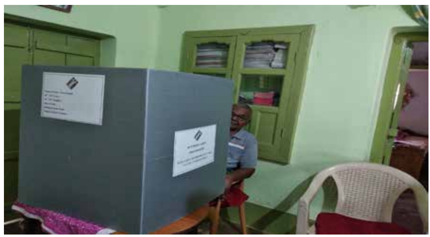
Casting of Absentee Postal Vote